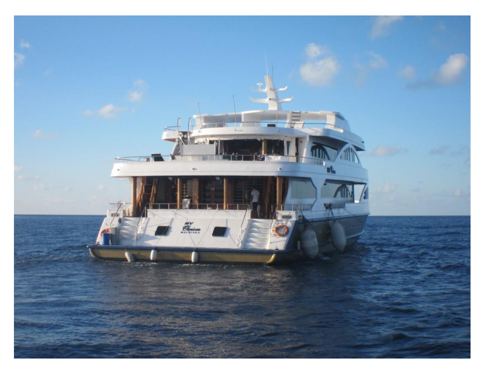
Day 2 – Leaving Male early the next morning we arrived at Vihamanaa for a check dive at 0730. This was followed by our first exciting dive at Lankan Manta Point, where we see real Mantas, but not many; only 4. Still it was a good start to the holiday and the promise of things to come. Banana reef was a bit of a letdown and not very inspiring with no Mantas, little marine life and poor coral.

We arrived in the Maldives at midday on Monday 10 Oct 11 after a reasonably comfortable 10 hour flight. It was then a short boat ride from the airport at Male to the MV Orion and a friendly welcome from the crew. We then had the rest of the afternoon to settle in to our luxurious and very comfortable cabins.